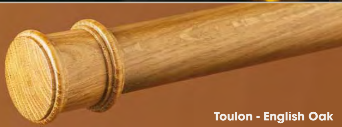
Toulon - English Oak