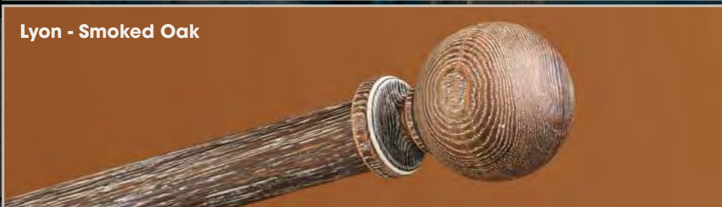
Lyon - Smoked Oak