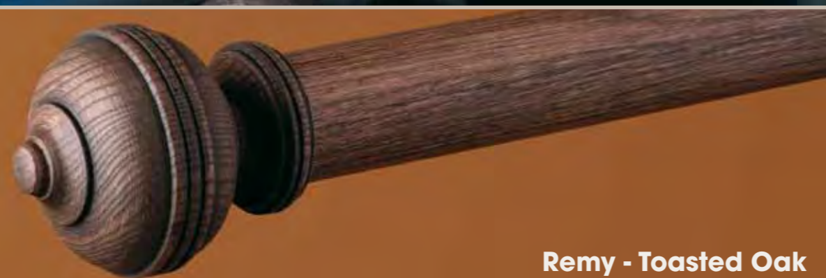
Remy - Toasted Oak