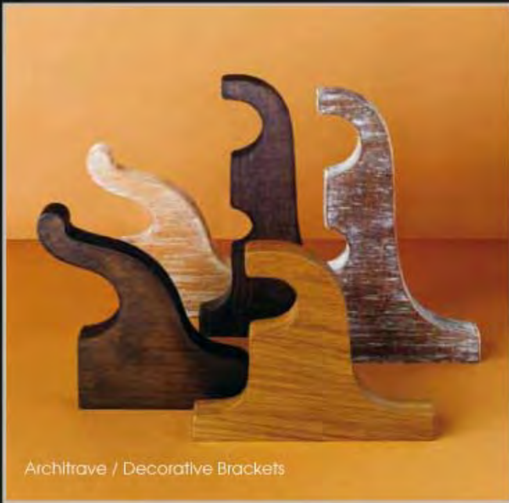
Architrave / Decorative Brackets