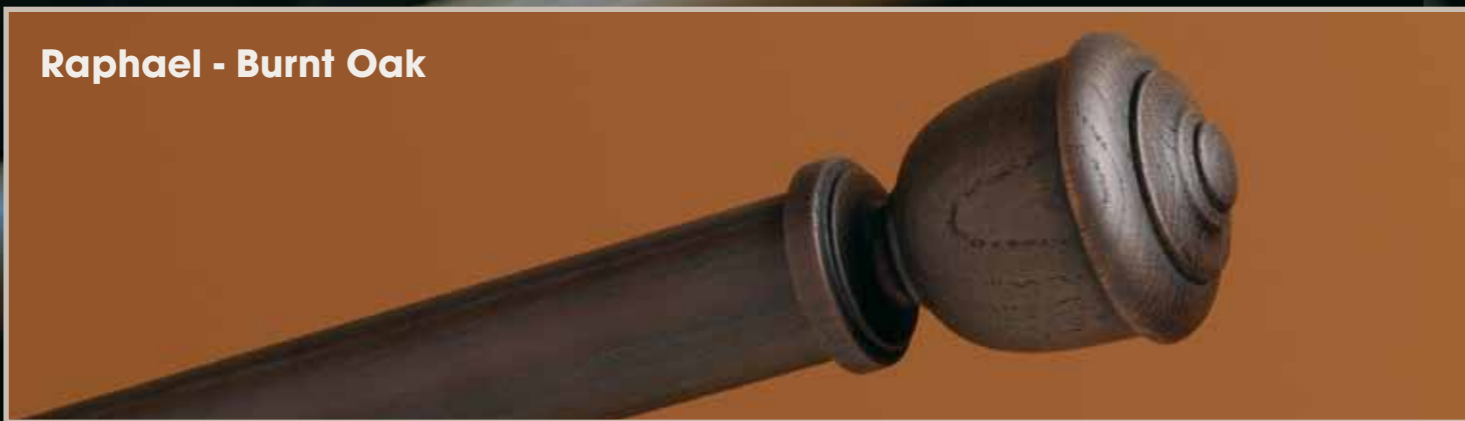
Raphael - Burnt Oak