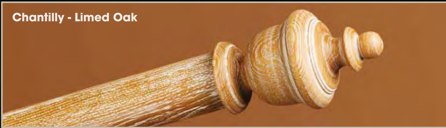
Chantilly - Limed Oak