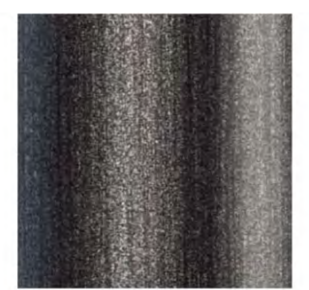
satin silver black